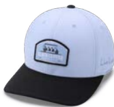
COUNTRY CLUBBIN ADJ - 826198