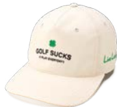
GOLF SUCKS ADJ - 826188