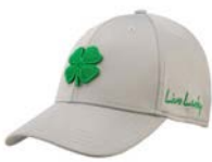
PREMIUM CLOVER 134 ADJ - 816008