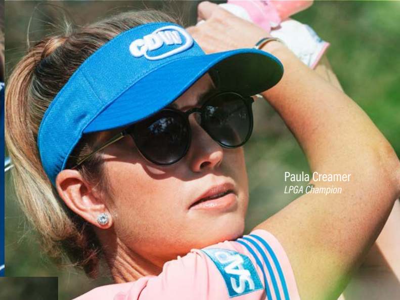
Paula Creamer LPGA Champion