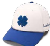
PREMIUM CLOVER 166 ADJ - 816048