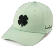
PREMIUM CLOVER 142 ADJ - 815028