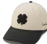
PREMIUM CLOVER 175 ADJ - 816088