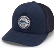
BIG TUNA ADJ - 826208