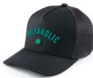
GOLFAHOLIC LID ADJ - 825328

CHECK OUT OUR COMPLETE OFFERING AT BLACKCLOVERCANADA.CA