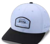
COUNTRY CLUBBIN ADJ - 826198