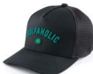
GOLFAHOLIC LID ADJ - 825328

CHECK OUT OUR COMPLETE OFFERING AT BLACKCLOVERCANADA.CA