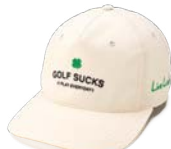
GOLF SUCKS ADJ - 826188