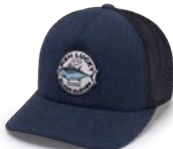
BIG TUNA ADJ - 826208