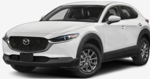
2025 CX-30 MSRP $29,300 * - $41,350*