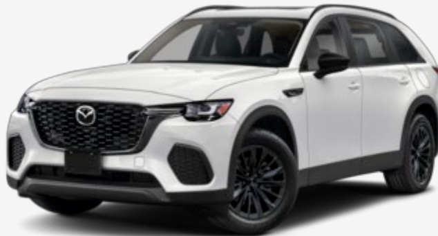
2025 CX-70 PHEV MSRP $58,750 * - $63,350*