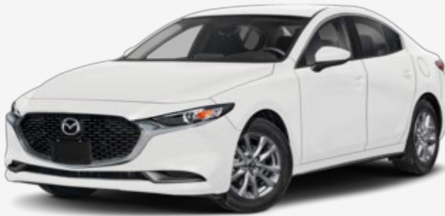
2025 Mazda3 MSRP $25,250 * - $38,450*