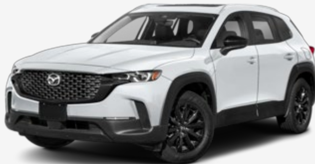
2025 CX-50 MSRP $39,950 * - $47,850*