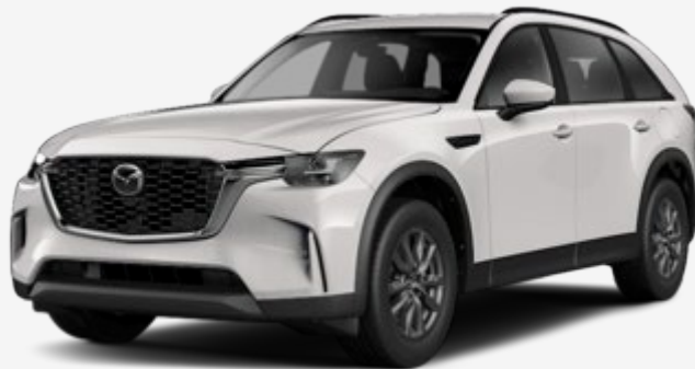
2025 CX-90 MHEV MSRP $46,250 * - $63,650*