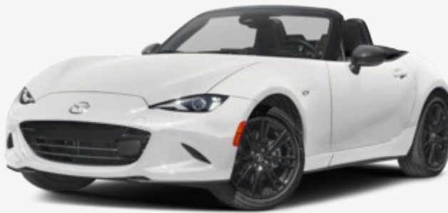
2025 MX-5 MSRP $35,450 * - $44,050*