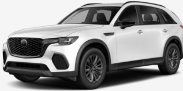
2025 CX-70 MHEV MSRP $49,750 * - $62,300*