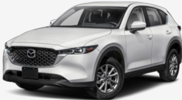
2025 CX-5 MSRP $32,900 * - $45,550*