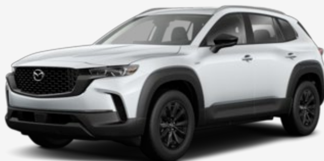
2025 CX-50 Hybrid MSRP $42,950 * - $48,350*