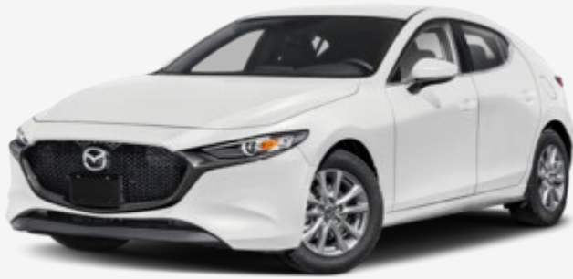
2025 Mazda3 Sport MSRP $26,000 * - $39,950*