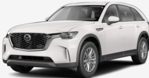
2025 CX-90 PHEV MSRP $54,900 * - $64,350*